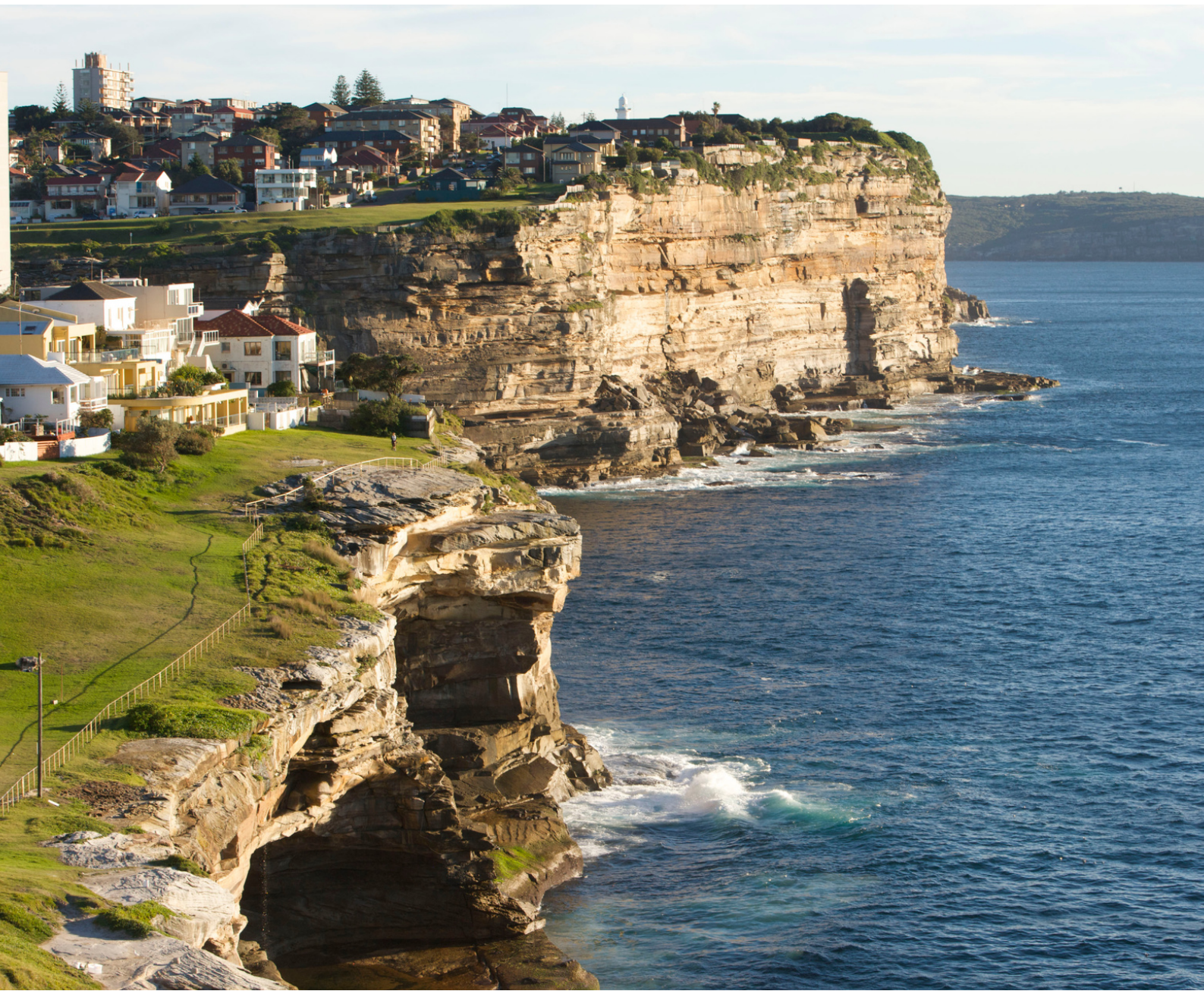
Image: Diamond Bay

The media coordinator has worked to develop a fortnightly newsletter of coastal news items, a quarterly ACS National newsletter and to increase community outreach through regular social media posts.