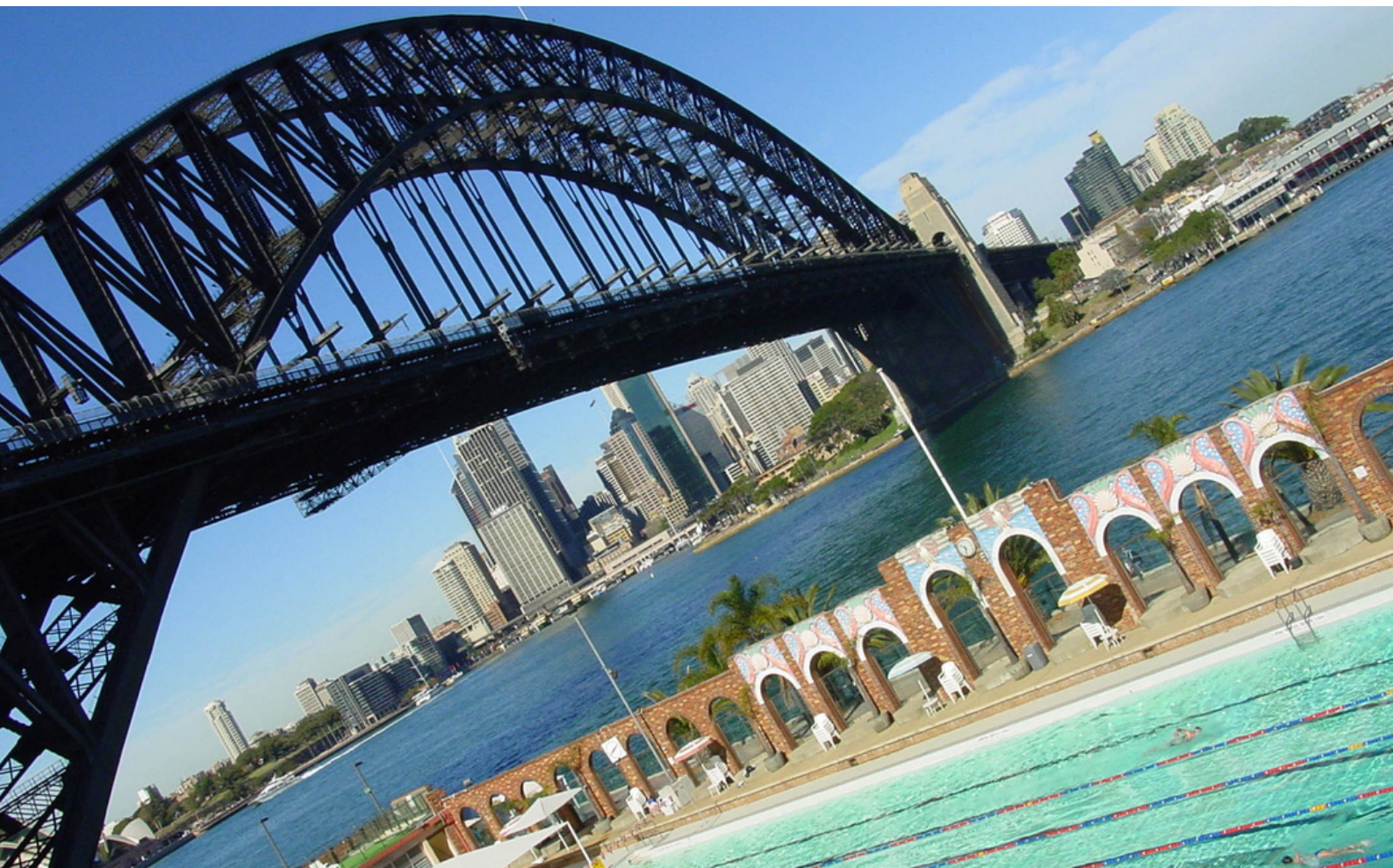
Image: Harbour Bridge