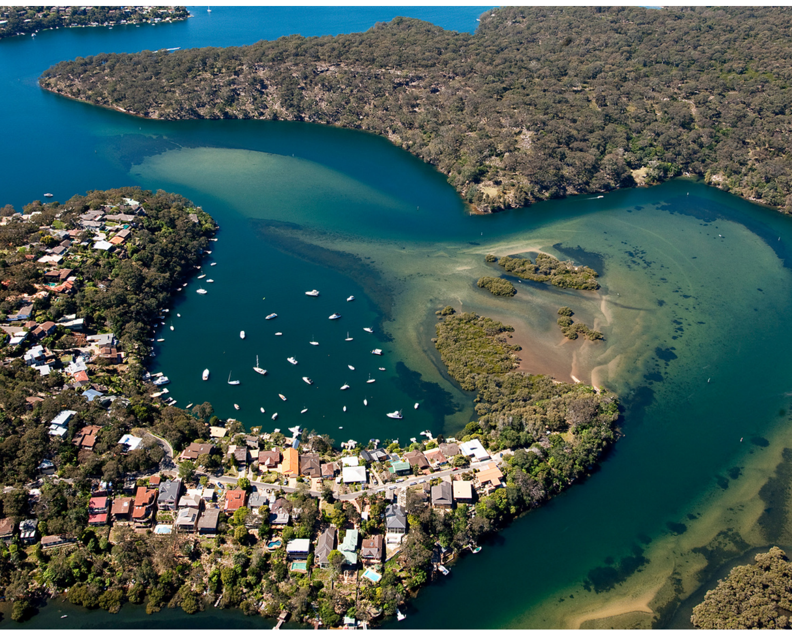
Image: Port Hacking River