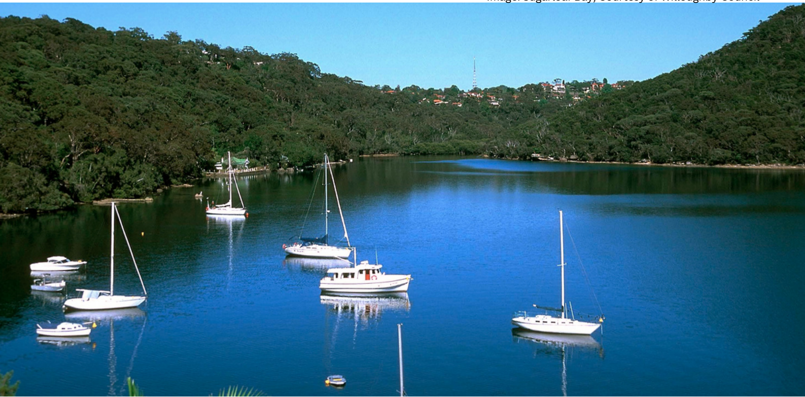
Image: Sugarloaf Bay

P3—Promote adaptive, integrated and participatory management of the coast.