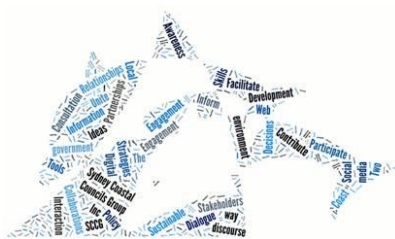
Our Becoming Social logo

This SCCG project will increase knowledge and skills in the use of social media as a policy development and relationship tool to engage, consult and educate communities in relation to coastal environmental policy development and management issues. For an update on this project visit the Project Page .