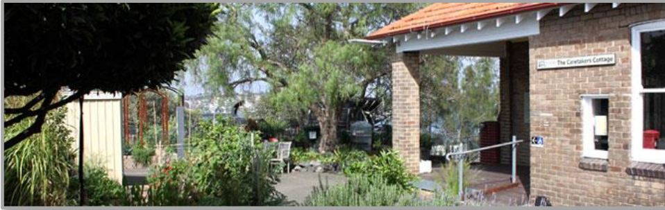
The Coal Loader, Waverton.

This event series is offered by the Sydney Coastal Councils Group to officers working across the Salty Program area. The seminars will present a valuable opportunity to engage with latest thinking and research as well as strengthen connections with a network of colleagues and researchers in the field.