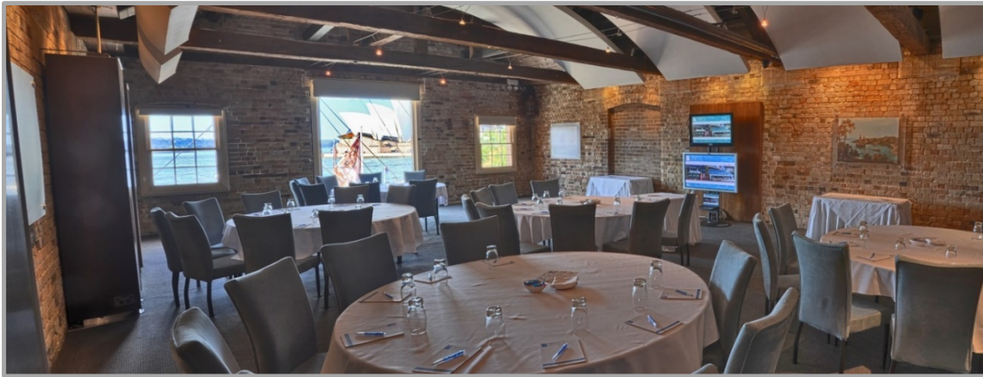
Settler's Hall, Waterfront, The Rocks.

This event is offered by the Sydney Coastal Councils Group with the support of the Department of the Environment to executives working across the Salty Program area.