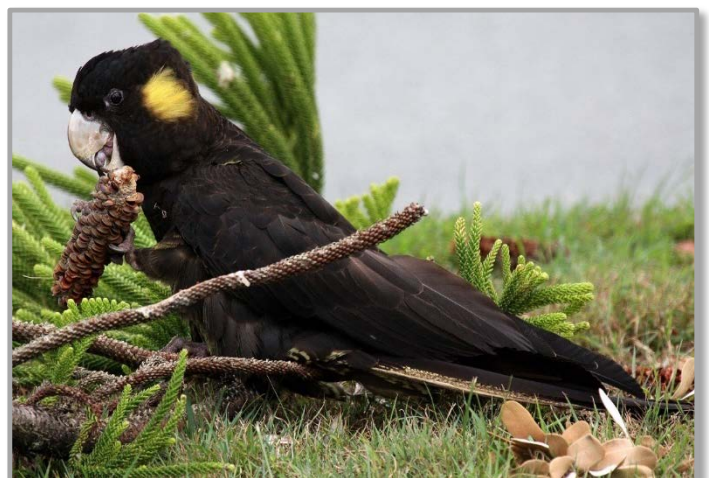
On ground implications